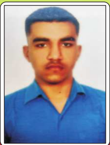
► School No 170 Cadet Aditya , Subroto House 2011-18, Indian Naval Academy Course No. 104

As now I am in Indian Naval Academy, I don't feel any uneasiness because all the activities that take place here are similar to that of Sainik School. The busy schedule of Sainik School starting from Morning PT to Breakfast then School, Lunch, Games, Recreational activities, Study period, etc. almost coincides with the routine of INA also. The physical development at Sainik School helped me in INA because here also several activities to show your physical mettle take place such as, X Country, Athletic Meet and Inter Squadrons games. It is due to the rigorous training that we get at Sainik School, we are able to outshine others in all these activities and the core values of the Navy (Duty, Honour and Courage) are endowed in us seamlessly. I just want to say that Sainik School Rewari provides opportunity and a clear-cut way to get success in life. Being a part of (2011-18) batch, I feel very proud to share such a great lineage.